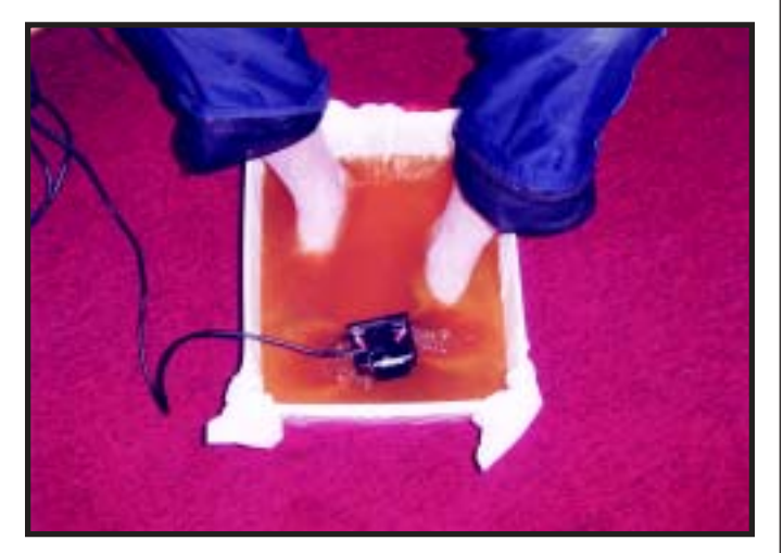
Photograph 4. With the elapsed time of 18 minutes into the detoxification session, the footbath water is becoming murky and bubbles of mucus are concentrating around the array. Such mucus indicates that this man is giving up his accumulation of medication taken over time for symptoms of an allergy to dairy products.