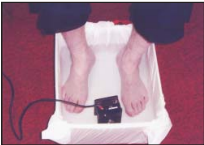
Photograph 1. At the start of a detoxification session using the IonCleanse, apparatus, footbath water shows up as clear just as it ran from the tap. Feet immersed in the water-filled basin are accompanied by the ionizing array attached to an electrical power supply delivering a low level direct current. This current causes the metals within the array in combination with water and salt to generate positively and negatively charged ions by separating oxygen and hydrogen in the water.