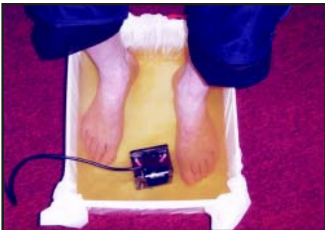
Photograph 2. Here is the detoxifying footbath as it appears 6 minutes into the session. The water is beginning to turn yellow, showing that detoxification is occurring through the individual's kidney and bladder area.