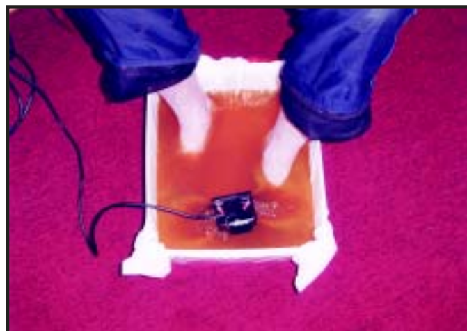
Photograph 4. With the elapsed time of 18 minutes into the detoxification session, the footbath water is becoming murky and bubbles of mucus are concentrating around the array. Such mucus indicates that this man is giving up his accumulation of medication taken over time for symptoms of an allergy to dairy products.