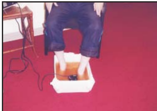
Photograph 3. This is the footbath as it appears 10 minutes into the detoxification session; water is beginning to turn orange-brown with orange indicating that metallic poisons are coming from the joints. The brown color shows that detoxification is occurring in the liver.